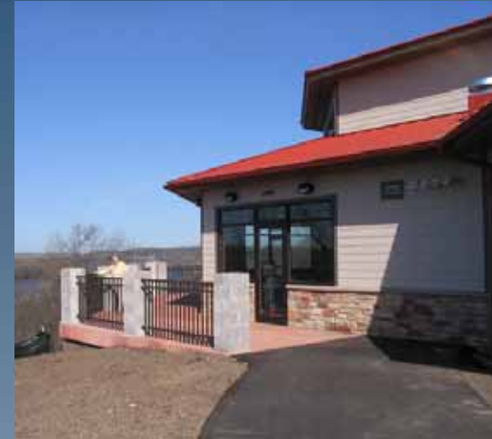
Prescott Visitor Center on the Great River Rd. in WI